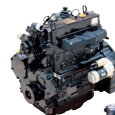
Diesel Engine 4TNE94L