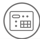
Industrial machinery and equipment