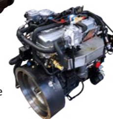
Gasoline / LPG Engine G424P(E)

This 3.0 liter diesel engine is designed exclusively for industrial applications. Especially, this engine provides great fuel efficiency, low noise and extended service intervals.